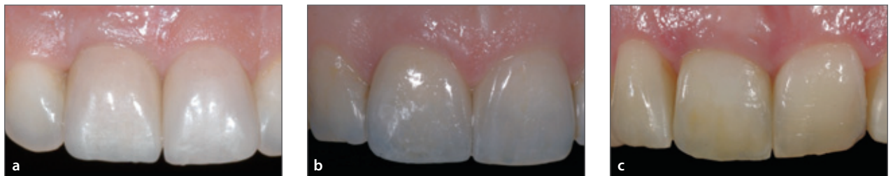
Fig 4 In order to achieve acceptable esthetic results, 65% of the teeth that were initially triangular in shape required an additional restoration on the adjacent central incisor, 40% of the square/tapered group required an additional restoration, and 13.3% of the square group required an additional restoration on the adjacent central incisor. (a) Final restoration on maxillary right central incisor. A porcelain laminate veneer was added on the maxillary left central incisor in order to modify the tooth shape from triangular to square. (b) Final restoration on maxillary right central incisor. A porcelain laminate veneer with no tooth preparation was added on the maxillary left central incisor in order to close the initial diastema. (c) The final restoration on maxillary right central incisor was placed, leaving an unaltered maxillary left central incisor.