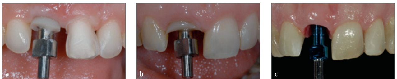
Fig 3 (a to c) Implant placement was performed in an ideal three-dimensional position.